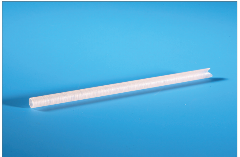
Fine Ground Sapphire Finish

Fine Ground Sapphire is frosted. It's ground surface roughness can be fine tuned for diffuser & low stiction applications. Fine Ground Sapphire tends to have micro-cracks that can trap water, gas & other impurities.