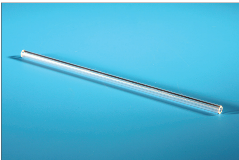
Polished Sapphire Finish

Polished Sapphire is clear and has little to no distortion & light scattering (depending on level of polishing). Polished Sapphire is ideal for optical applications, high purity semiconductor, chemical & vacuum processing.